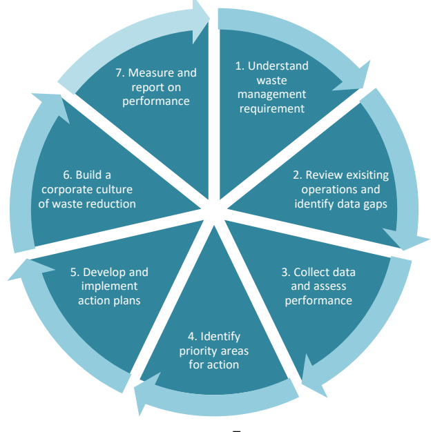
Figure 3: Cycle of continuous improvement in waste management

Continuous Improvement: The diagram below illustrates how the activities that we propose for the plan will align with a cycle of continuous improvement in the department's office-based operation.