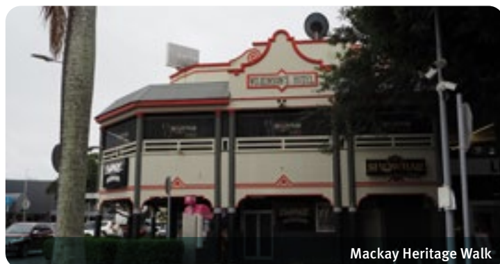
Mackay Heritage Walk

Designated disabled parking is available in front of the building. There is a ramp to the left-hand side of the main entry stairs. Inside all levels of the facility are linked by ramps and there is level access onto the deck in front of the dining spaces that looks out over the playing fields. The dining spaces are accessible with wide aisles and moveable furniture. Accessible toilet facilities are located behind the main server and have side and rear hand rails and a back rest.