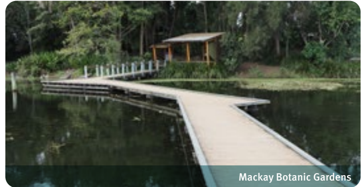
Mackay Botanic Gardens

The lagoons have zero depth entry or a ramp and the children's splash area is level throughout. A waterproof wheelchair is available for pool entry or for the splash park. There is an accessible toilet and accessible shower available.