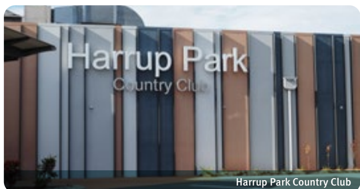
Harrup Park Country Club

In addition to the hand basin is a large dual height change table and separate sink. There is an accessible drinking fountain outside the toilet with a water bowl for service animals. There is a large observation deck that gives great views over the gardens. The paths throughout the gardens are either concrete or asphalt and are gently sloping throughout. The main boardwalk through the wetlands is wooden with raised edges for the protection of wheelchair users and to provide a tapping reference for people with low vision. A second car park is located off Ram Chandra Place which gives access to the South Sea Islander Garden of Memories, a garden that recognises the contribution of South Sea islanders to the sugar industry.