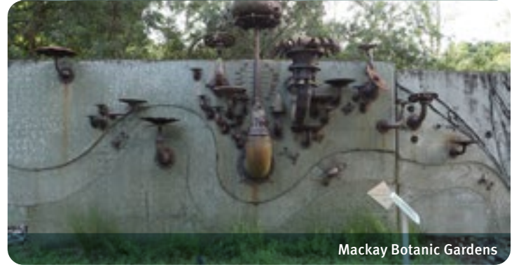
Mackay Botanic Gardens