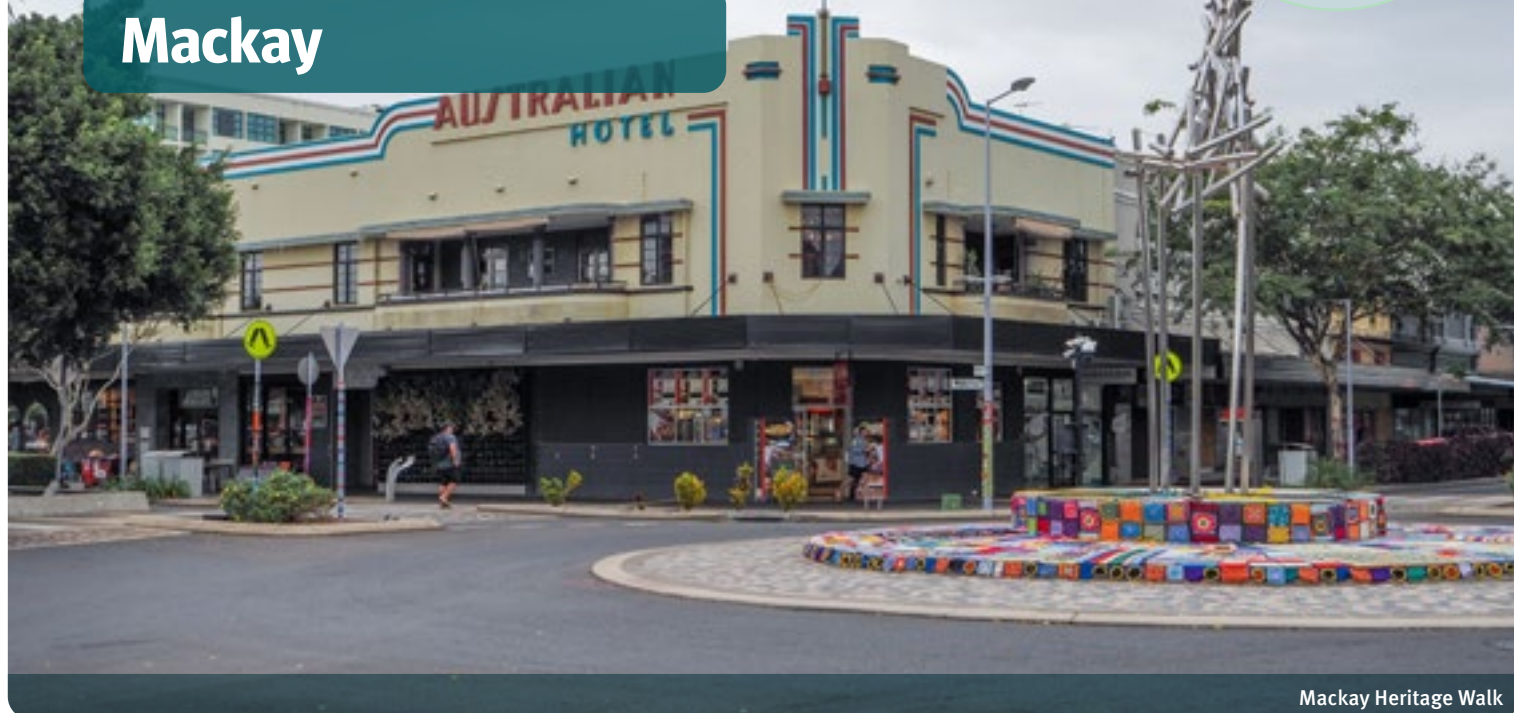
Mackay Heritage Walk

The Mackay region is located in North Queensland. It is bordered by the Whitsunday Region to the north, the Isaac Region to the south, and the Central Highlands Region to the west.