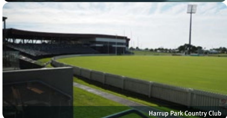
Harrup Park Country Club