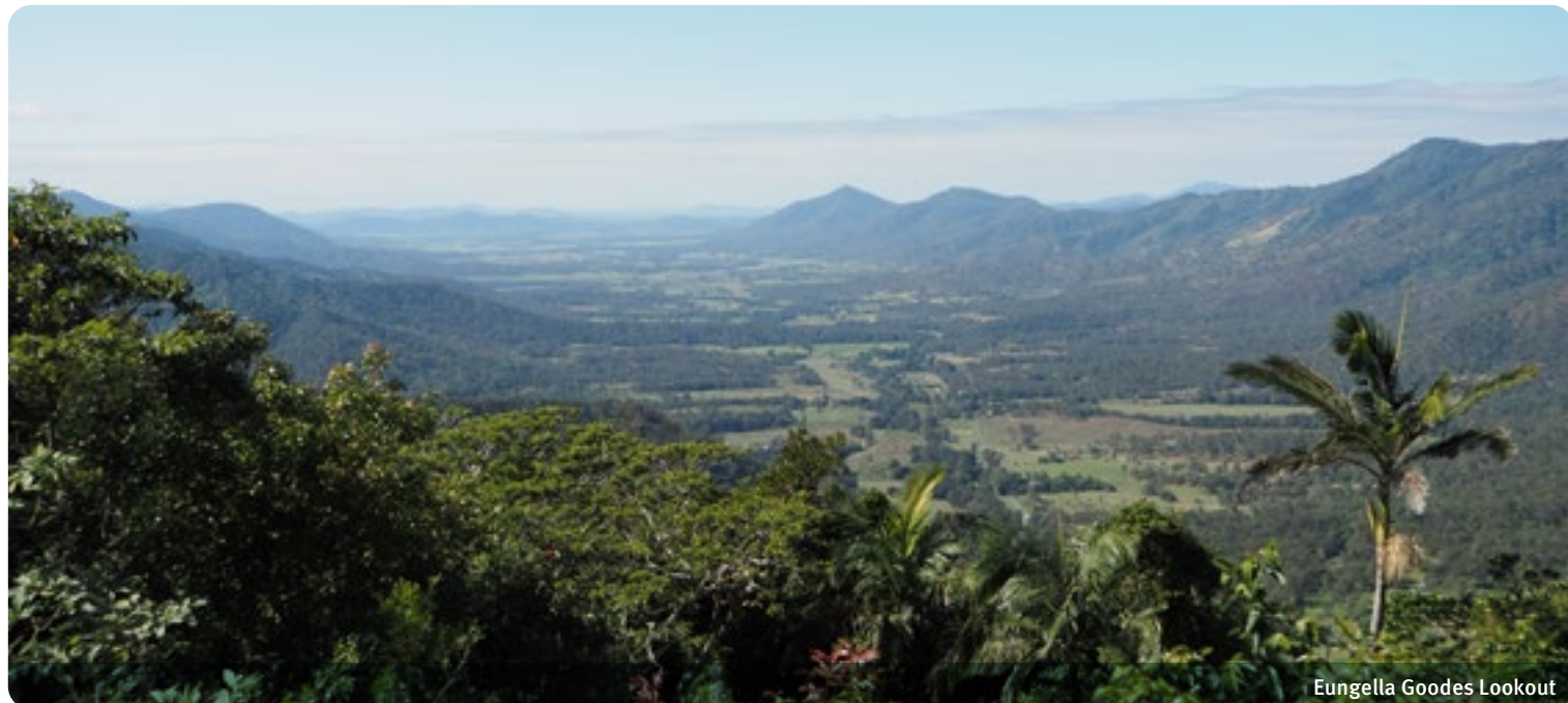
Eungella Goodes Lookout