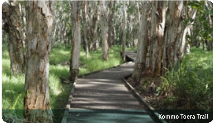
Kommo Toera Trail