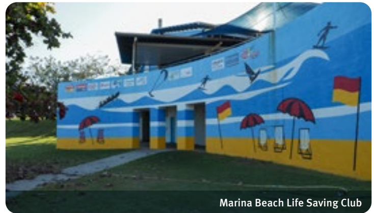
Marina Beach Life Saving Club

Behind the marina is J.M. Mulherin Memorial Park. The park contains a giant statue of Fred Flintstone, a giant shoe, and a giant crocodile. There are concrete paths throughout the park. It has accessible picnic tables and several accessible barbecues. Accessible toilet facilities are available near the entrance to the park of the car park.