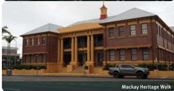
Mackay Heritage Walk