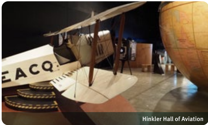
Hinkler Hall of Aviation