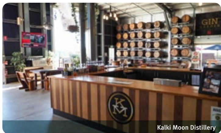
Kalki Moon Distillery

The hotel has one wheelchair accessible room on the ground floor directly off the main reception desk. There is a ramp that leads down onto the deck that overlooks the river. The tables and chairs are all moveable. There is an accessible toilet located off the courtyard from the bar area. Parking is available.