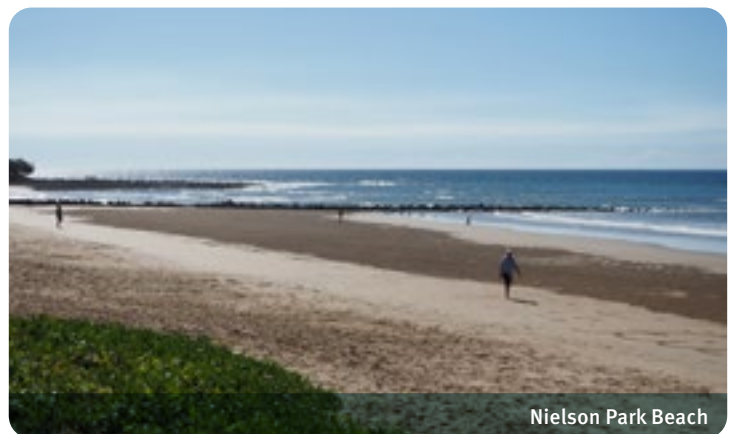
Nielson Park Beach

Within the centre is the Milbi Café and a gift shop. There are accessible toilet facilities behind the reception desk. There is a quiet space located within the discovery experience.