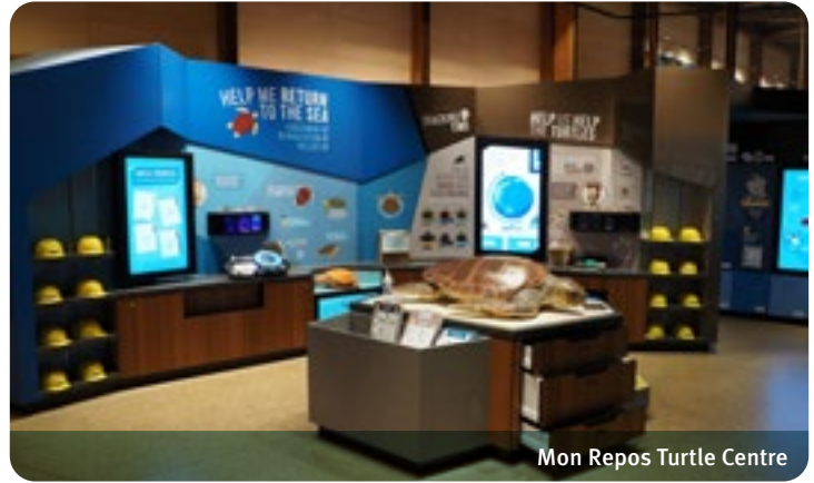
Mon Repos Turtle Centre

There are two designated disabled parking spots and a concrete ramp that leads down to the beach and the small inlet. The ramp ends on soft sand. The car park on the other side of the inlet has steps down to the beach.