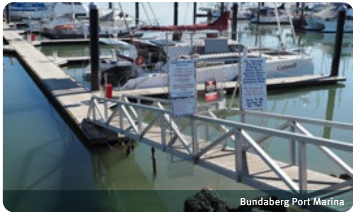
Bundaberg Port Marina

The beach has a concrete access ramp and during the summer months beach matting is rolled out by the Surf Life Saving Club. A beach wheelchair is available from the club. Accessible toilets are available on the outside of the lifesaving club building. Accessible picnic tables and barbecues are available in the park behind the beach.