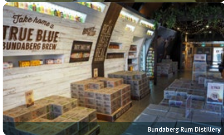
Bundaberg Rum Distillery