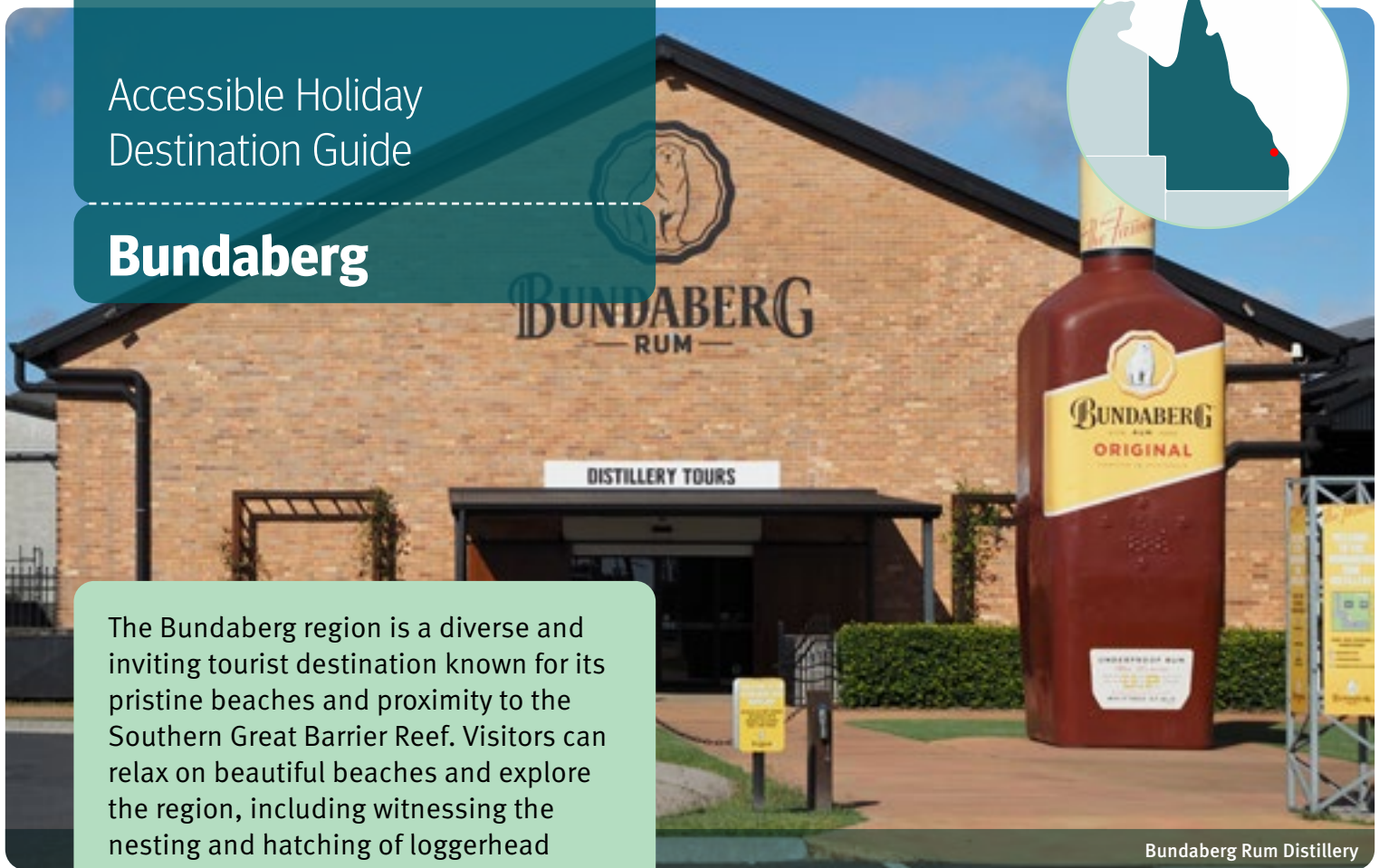
Bundaberg Rum Distillery

The Bundaberg region is a diverse and inviting tourist destination known for its pristine beaches and proximity to the Southern Great Barrier Reef. Visitors can relax on beautiful beaches and explore the region, including witnessing the nesting and hatching of loggerhead turtles at Mon Repos Conservation Park. The area also offers farmers' markets, and farm-to-table dining opportunities, thanks to its thriving sugar cane plantations and farms. History enthusiasts can explore the region's heritage through historic buildings, art galleries, and attractions like the Hinkler Hall of Aviation, dedicated to aviator Bert Hinkler. Charming towns like Childers offer well-preserved architecture and a glimpse into the past.