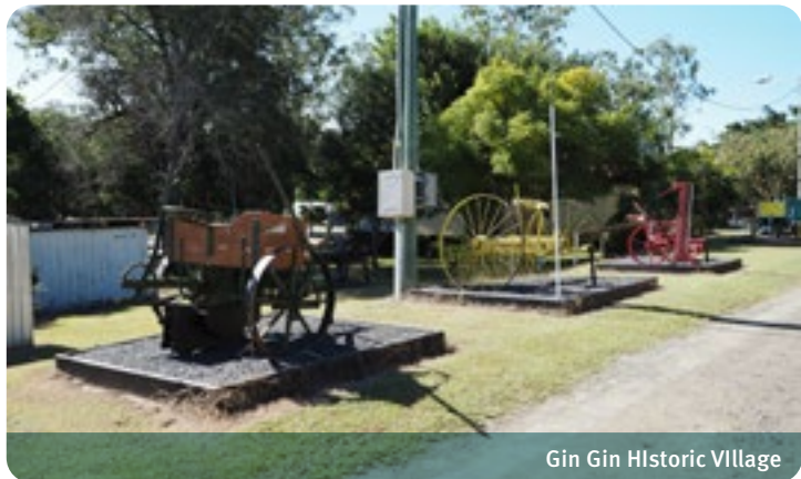
Gin Gin Historic Village

There is a small gravel car park. There is no designated disabled parking. The surface is fine crushed rock. A gravel roadway leads through the village with displays of old machinery along its edge. Most of the buildings have either level access from the grass verge of the driveway or have ramped access.