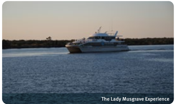
The Lady Musgrave Experience

The main ticket office is in Bargara. The voyages sail from Burnett Heads Marina. The Reef Express has significant limitations for people with a disability. The gangway only connects the small lower rear deck to