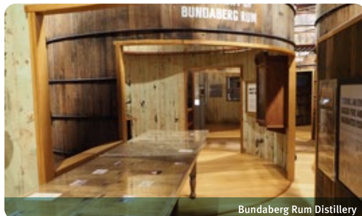
Bundaberg Rum Distillery

shop is well-organized with wide aisles and reachable merchandise. Accessible toilets are available, and the distillery accepts the Companion Card for its tour options.