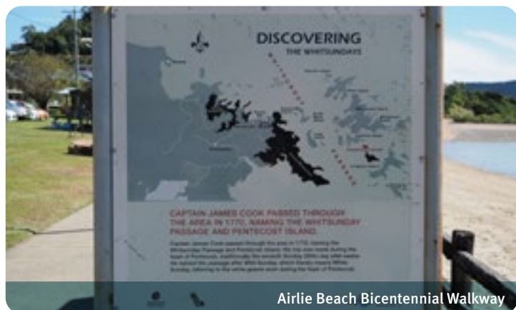
Airlie Beach Bicentennial Walkway

and murals. At the Canonvale Foreshore Reserve, there is designated disabled parking, accessible picnic tables and an accessible BBQ. Accessible toilets are also available. The paths are all wide concrete or wooden boardwalks. There are seats placed at regular intervals.