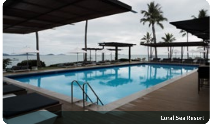
Coral Sea Resort

access into the terminal building. The north precinct has only one disabled spot which is narrow. The two precincts are linked by a footpath leading around the back of the boat maintenance yard. Ocean Rafting and Red Cat Adventures operate from the north precinct. Whitsundays Jetski Tours and the Hayman Island ferry operate from the south precinct. There are accessible toilet facilities in both precincts.