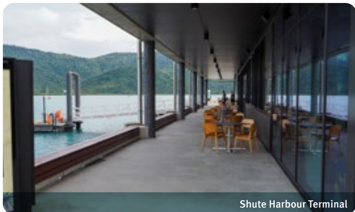
Shute Harbour Terminal

Shute Harbour is a small coastal harbour located 10 kilometres east of Airlie Beach and is a popular destination for boaters and tourists. The harbour is sheltered from the open ocean by Hook Island and provides a safe anchorage for boats. There are a number of boat charter companies operating out of Shute Harbour, and it is a popular starting point for exploring the Whitsunday Islands.