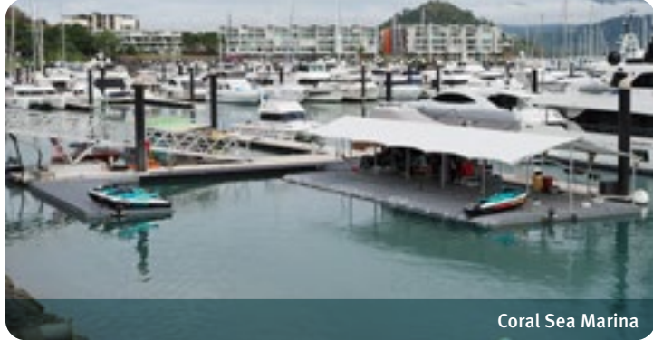
Coral Sea Marina