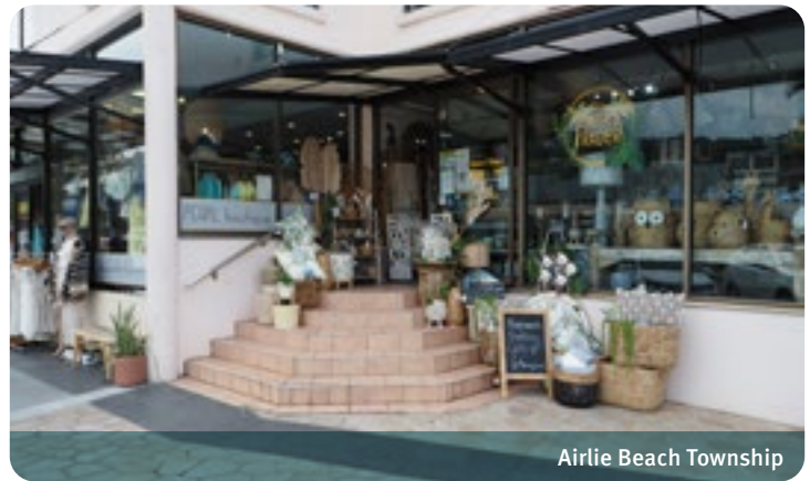
Airlie Beach Township

Airlie Beach is a compact town. The main street footpaths have been upgraded and are wide and smooth. Many of the shops and cafés along the main street still have steps at their entrances, and level entry. The lower foreshore esplanade provides access to the foreshore cafés which are all ramped or have level entry. There are several designated disabled parking spaces available along the main street and in the car