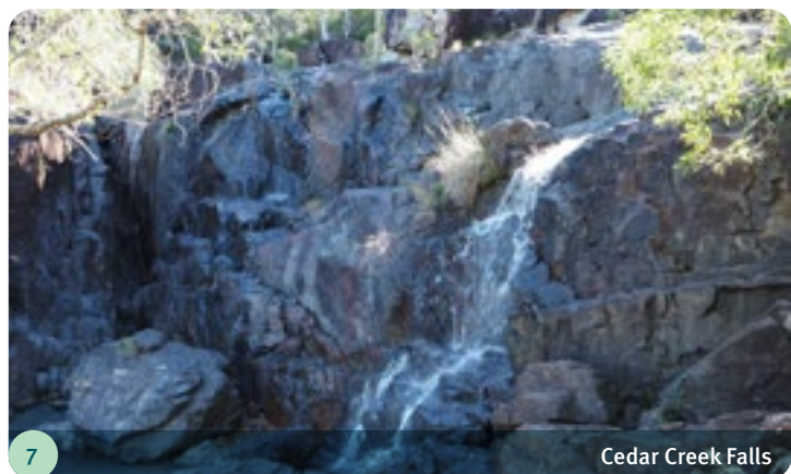
Cedar Creek Falls

Cedar Creek Falls is a beautiful waterfall located about 30 kilometres from Airlie Beach and 20 kilometres from Proserpine. The falls cascade over a series of rocks into a crystal-clear swimming hole. The best time to visit