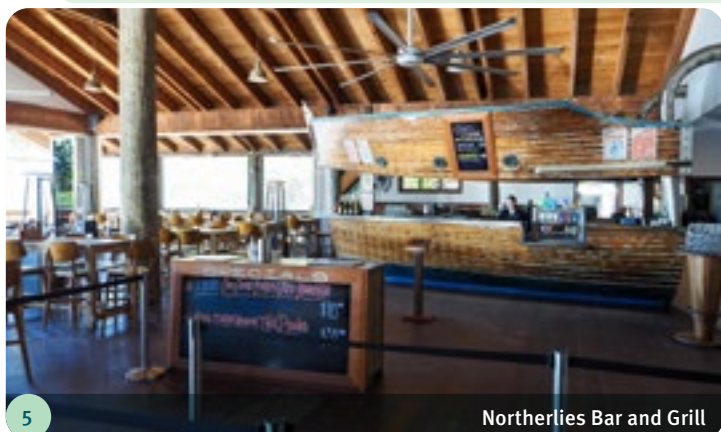
Northerlies Bar and Grill

Freedom Shores is also a popular choice for families and groups of friends. There is one accessible room at Freedom Shores located off the main reception area. There is a disabled parking spot available in the upper car park. There are ramps between the car park and reception and out onto the pool deck. The restaurant for Freedom Shores is the Northerlies Bar and Grill. It is a steep road down to the restaurant so it is advisable to drive down.