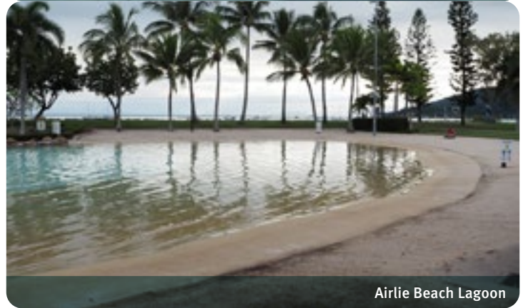
Airlie Beach Lagoon

park adjacent to the lagoon. Anyone displaying an authorised disabled parking sticker in their windscreen can park anywhere in Airlie Beach, including metered parking, free of charge for any duration.