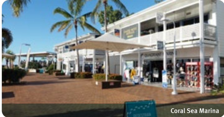
Coral Sea Marina

The 3 Little Birds Espresso and Creative Hub is located in Shute Harbour Road. The coffee shop offers a variety of coffee drinks, pastries, and light meals. The creative hub offers art classes and workshops for all levels. The doors to both the café and workshop are wide providing level access from the street.