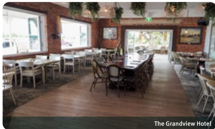
The Grandview Hotel

Parking is available in front of the museum. There is a metal ramp over the gutter and a concrete path leading to the front of the building. There is a small step leading to the ramp to the main door. The museum has a portable ramp inside to allow access over the step and there is a bell on the outside of the building to ring for assistance. The museum has a wide door leading into the lower level. The upper level is reached by climbing a short staircase or by exiting the building and re-entering through the side door towards the back of the building. There are no accessible toilets located at the museum.